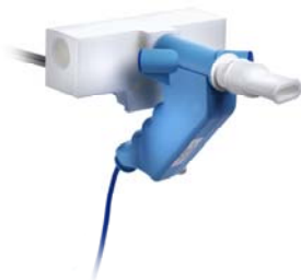
FRC Pre-School Set up

The system is capable to perform all lung function test procedures as described in the book "Infant Respiratory Function Testing" (1), Paediatric Pulmonary Function Testing (2) and in the ATS / ERS standards (1).